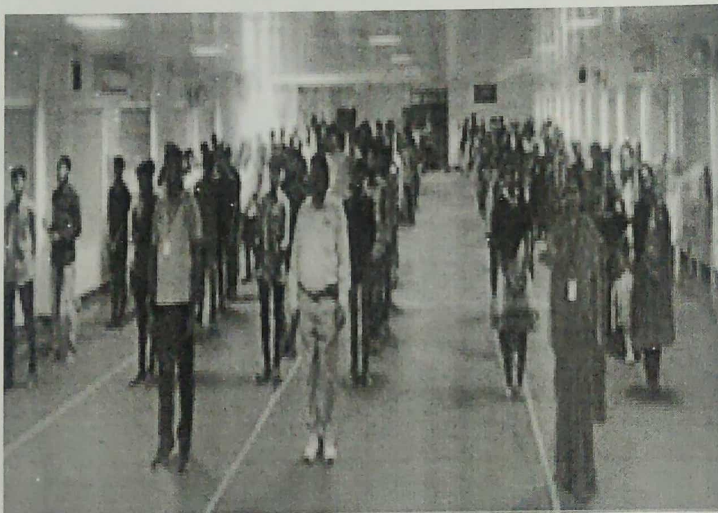
Students participated in Yoga and body fitness in Seminar Hall

Kishu PRINCIPAL MAHAVEER INSTITUTE OF SCIENCE & TECHNOLOGY Bandlaguda, Hyd-500 005.